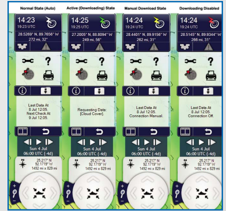
C-Comm Weather's graphical displays and icons are clear and easy to read, providing in-depth, up to the minute data.